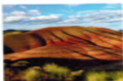
Painted Hills Unit