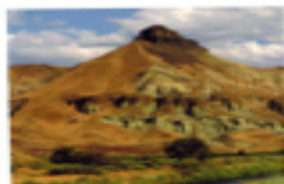
Sheep Rock Unit

Hiking trails are available year-round during daylight hours at all three units.